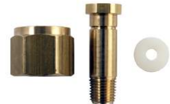
320 Nut & Nipple Assembly